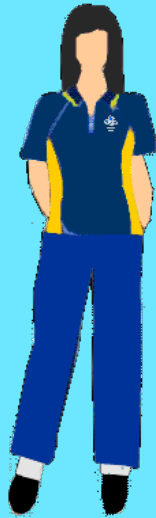
New uniforms 2010